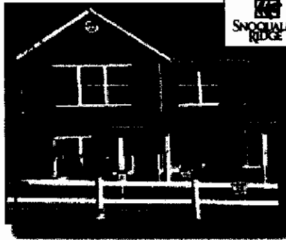
Builder: Quadrant – Location: Snoqualmie