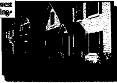
Builder: Quadrant – Location: DuPont