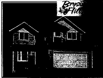
Builder: Legend Homes - Location: Everett