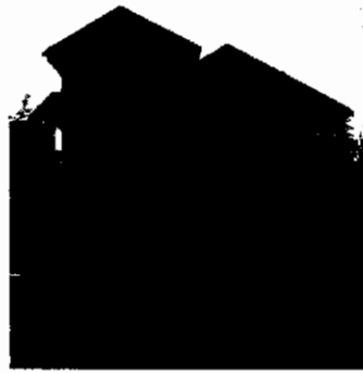
Builder: Quill Cove, LLC / Barclays North, LLC – Location: Lake Stevens